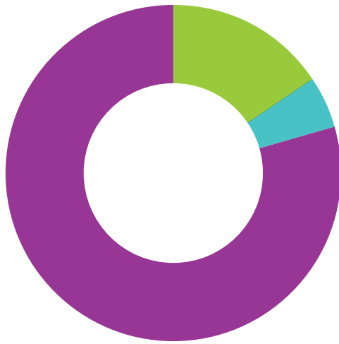
Mount Pearl North (2015 General Election)